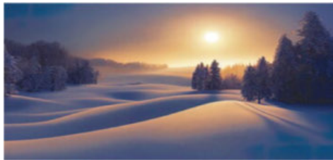
God loves you. Pay Attention.